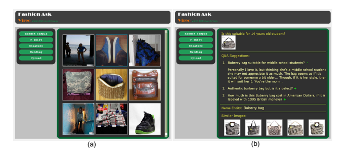
Figure 2: Interface for FashionAsk: (a) showing examples of fashion pictures in our dataset; (b) asking a question by picking or uploading a picture, and followed by the answer and suggested questions returned by our system.

Interface. The system can be accessed through a Web browser operated either on a PC client or a mobile phone.